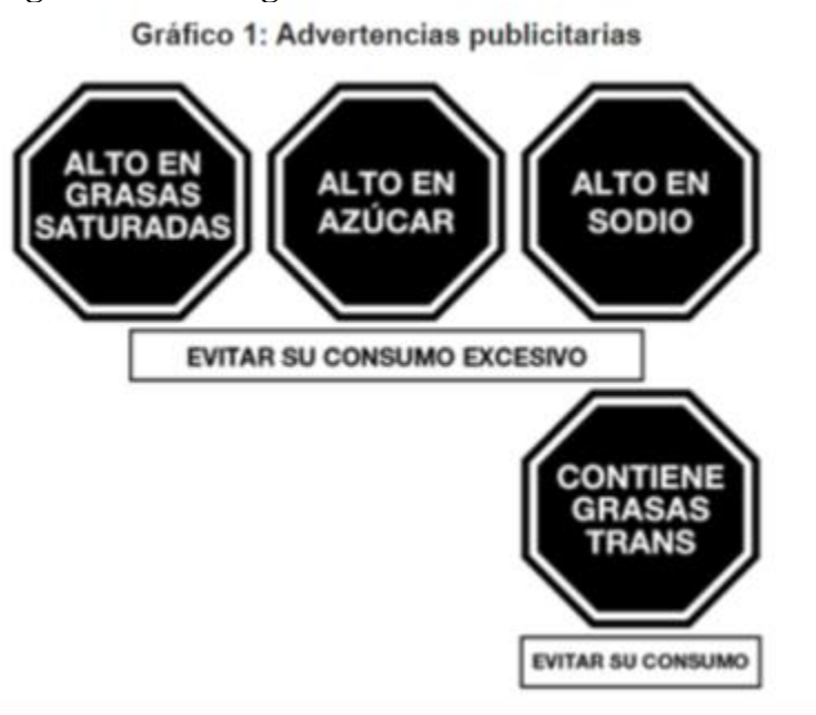
Figure 1: Warning Label Format

Advertising warnings should be clear, legible, prominent, and understandable. The label should be placed on the front side of the product's packaging, according to the following specifications and details included in Annex 1 of the Warning Label Manual :